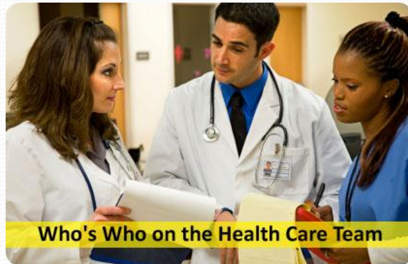
Who's Who on the Health Care Team